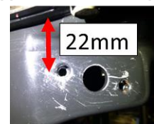
LANCER EVO VIII MR-IXMR