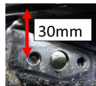
LANCER EVO VII-VIII