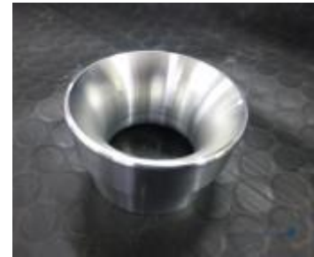
● Special Restrictor