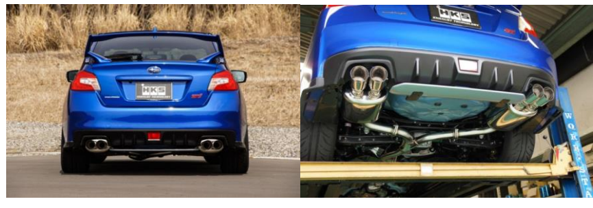
Code No. 31021-BF001 Price: