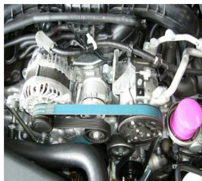
• The engine cover was removed for an image photographing