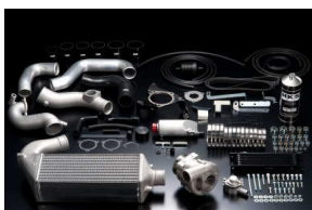
GT S/C SYSTEM