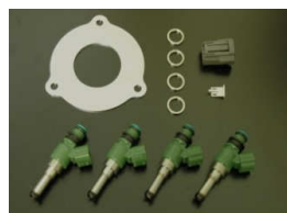
Fuel UP GRADE kit