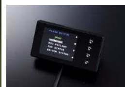
Flash Editor (Available only for JDM Vehicle)