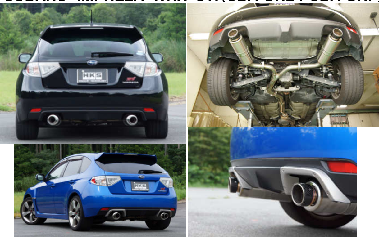
Code No. 31019-AF027